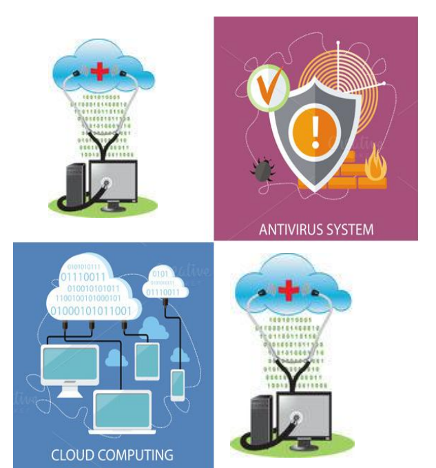
Figure 3. Cloud Anti-virus

Cloud anti-virus is anti-malware technology that uses agent software on the protected endpoint, while offloading the majority of data analysis to the provider's infrastructure. Cloud anti-virus is usually combined with malware detection techniques which are found in traditional anti-virus products for identifying malware. Cloud anti-virus employs agent software on the protected endpoint that is much lighter than the installed Prevention is the best remedy for avoiding virus infections components of traditional anti-virus tools. This implies and threats. A virus can compromise personal information that cloud anti-virus imposes less strain on the system's and even destroy a computer completely. It becomes a resources.