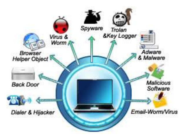
Figure 1. Viruses, Trojan horses and worms

Computers are very essential in our life, and since the first days of appearance of early viruses, there is a big contest between virus creators and anti-virus experts. A computer virus is a program that recursively and explicitly copies its evolved version. Computer Virus is a program file capable of reproducing its own special code and attaching that code to other files without the knowledge of the user. A virus copies itself to a host file or system area. Once it gets control, it multiplies itself to form newer generations.